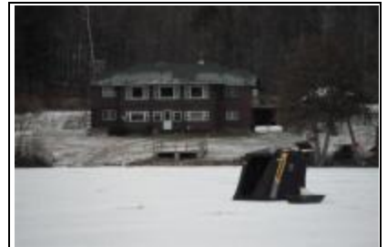
Ice Shanty Near the Lodge

How about a pond where there is so much action you have little or no time to jig... where you can catch a trophy pike on one tip-up and moments later catch another one on a different tip-up...where you can catch both large and smallmouth bass of well over legal size. How about a pond where the perch are big and plentiful...where you have trouble getting your hand around the crappies you catch? A pond that is only 50 feet away from our lodge where two people can go thru 11 dozen minnows in two days of ice fishing the bite is that good. How's that sound? Well, I have just described our pond, LONG POND! The action is fast and constant and if you spread your tip-ups out, which we strongly suggest you do, you will be very tired at the end of each day.