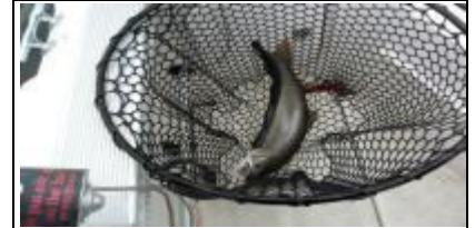
Lamprey Attached to Lake Trout