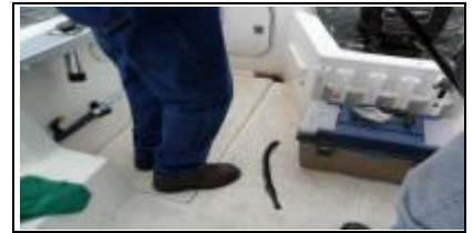
Live Lamprey on the Floor

After years of testing various methods and experiencing many delays, a solution was found to combat the lamprey. After a regimen of lampricide treatments in rivers around Lake Champlain, sea lamprey populations shrank and fish became more numerous and healthier. With constant monitoring, a sharp decrease in the number of lamprey wounds was apparent and larger and older salmon were showing up in the fish population. Thanks to the scientists' efforts, the fishing has improved and anglers willing to brave the chilly weather can do well this time of the year. The fish run shallow now and can also be caught from shore.