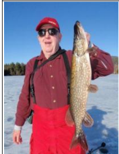
Long Pond Ice Fishing