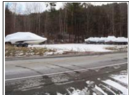
The Boats are Ready for Winter

We were very concerned about the lack of launching docks early in the season because of the flood conditions. This made launching very difficult for some of our older clients. We were also concerned when the docks were pulled out of the lake so early in the fishing season, right after Columbus Day. We want to thank all of our clients for putting up with these difficult conditions, which we had no control over. We felt so badly about these conditions we had to take some form of action. We have written to our local Congress and Legislative representatives and the Chamber of Commerce requesting their assistance in the future to ensure the docks are installed right after the ice goes