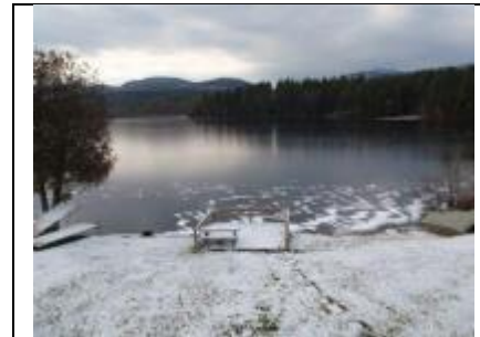
Long Pond is Frozen 12/19/11

We wanted to do something to help our clients and we chose no price increase. HAPPY NEW YEAR!!!!