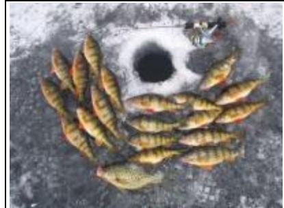
Perch Caught through the Ice Caught 12/30/2011