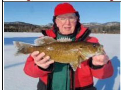
Long Pond Ice Fishing