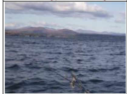
Big Rough Water