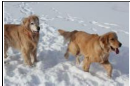
Bear and Jack

Weekends and especially holiday weekends are very busy for us and book up first and fast. I would