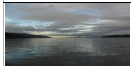
Cloudy, Calm Day